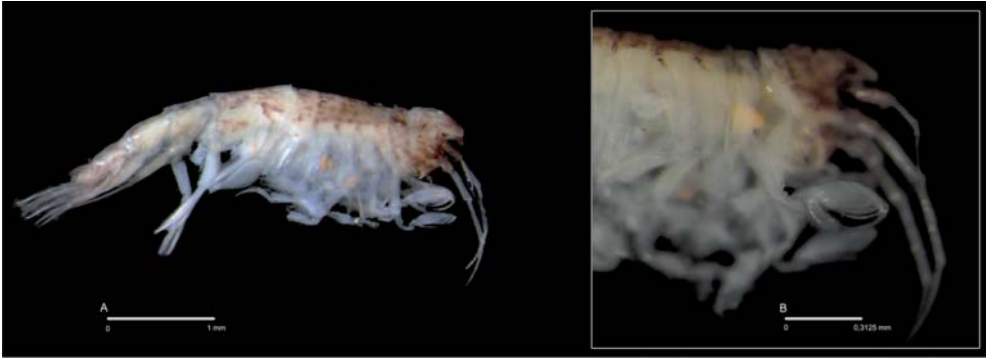
Figure 3.- Monoculodes carinatus (Bate, 1857). A. General aspect. B. Anterior end and gnathopod 2.