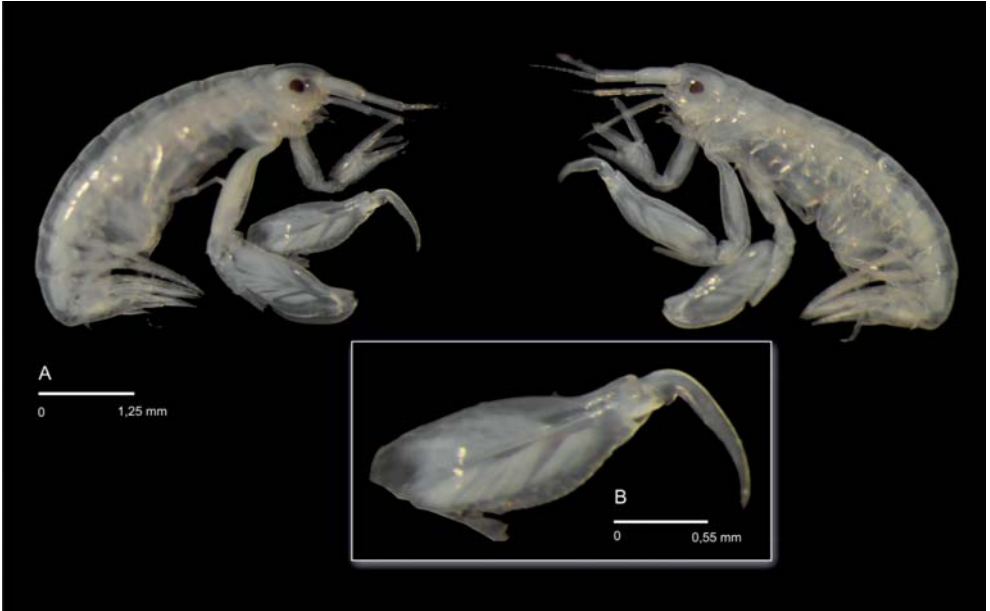
Figure 2.- Leucothoe incisa (Robertson, 1892). A. General aspect. B. Male gnathopod 2.