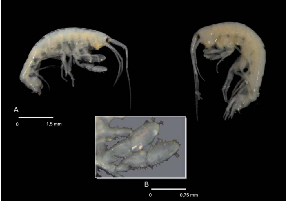
Figure 1.- Aminoceradocus semiserratus (Bate, 1862). A. General aspect. B. Male gnathopod 2.