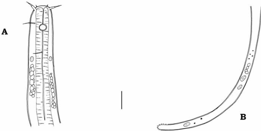
Figure 2.- Trefusia aff. pseudolitoralis . Juvenile. A. Anterior end. B. Posterior end. Scale = 15 \mu m.